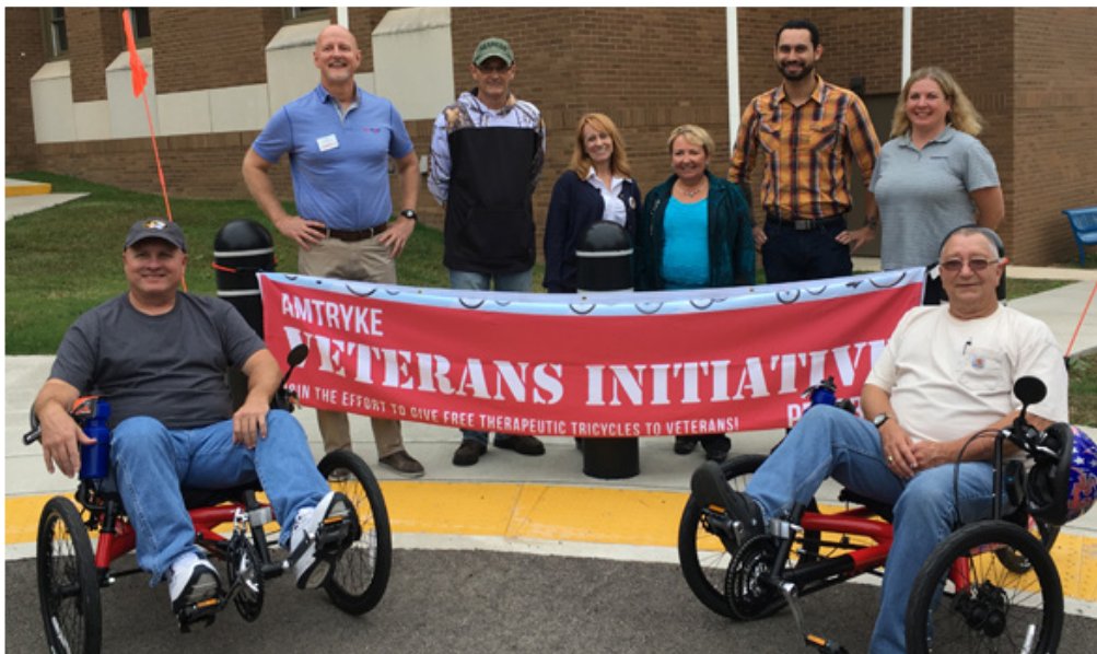
Veterans display donated adaptive bikes during a November 2017 Health on Wheels event at the John J. Pershing VA Medical Center in Poplar Bluff, Missouri.