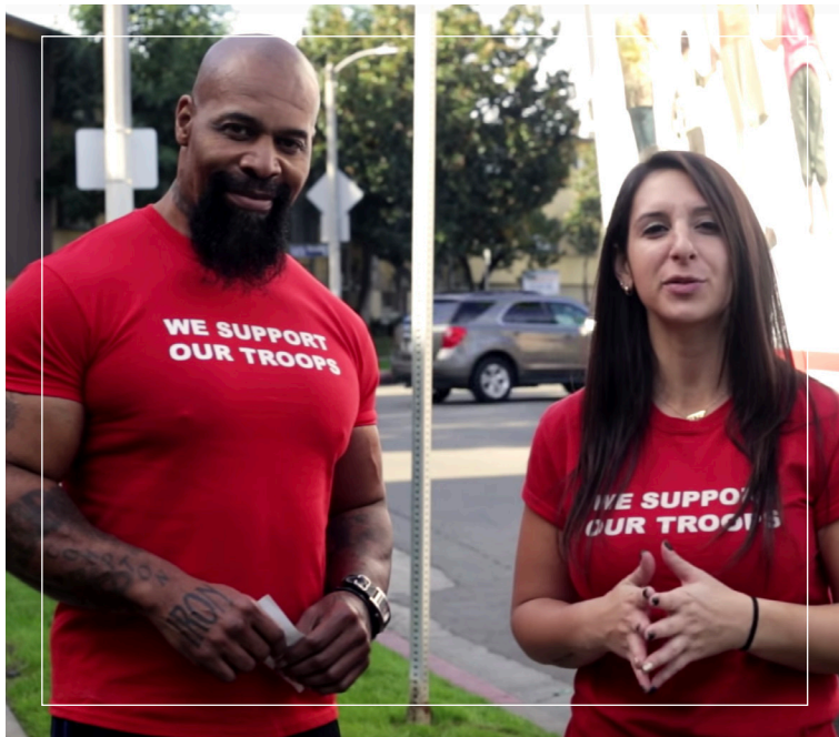
Team AMVETS volunteers