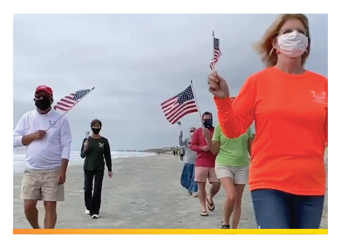
VFW Post 3137 marches down a beach to honor Veterans.

Partnerships allow VHA to address urgent and emerging Veteran needs, often by incorporating creative ideas from private-sector partners. OCE serves as the expert on partnerships within VHA. For more information, visit VA.gov/healthpartnerships.