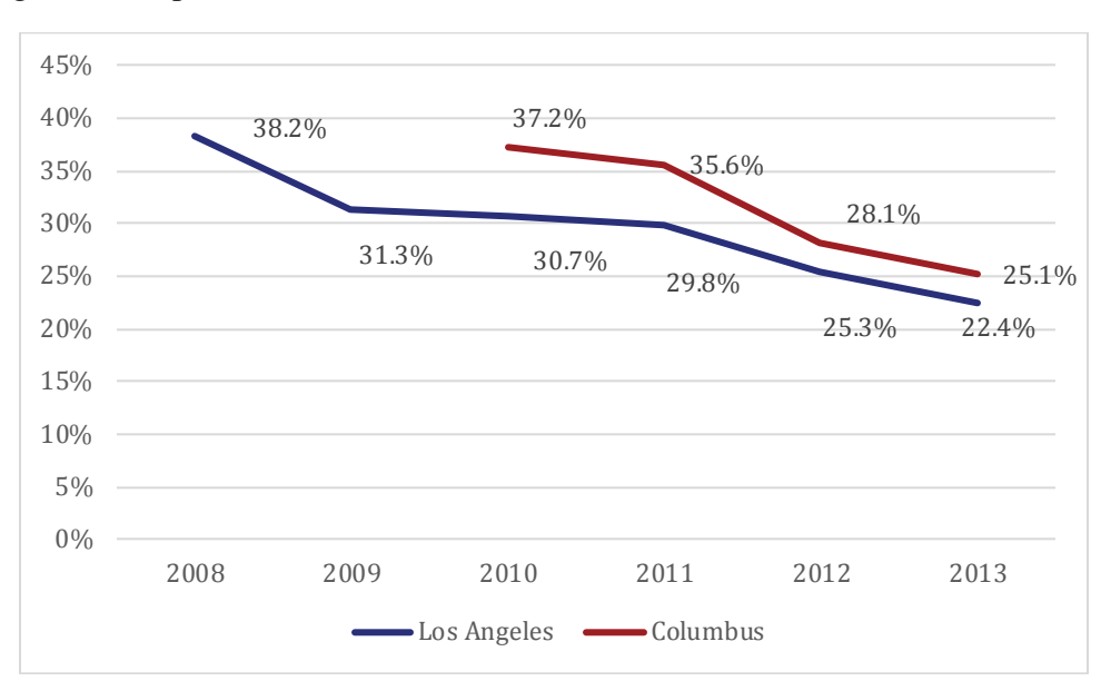
Figure 1: Proportion of Veterans Not Self-Identified as Veterans in HMIS Records