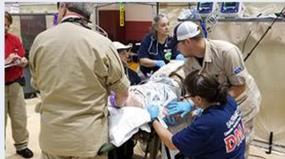
Building a Regional Disaster Health Response System