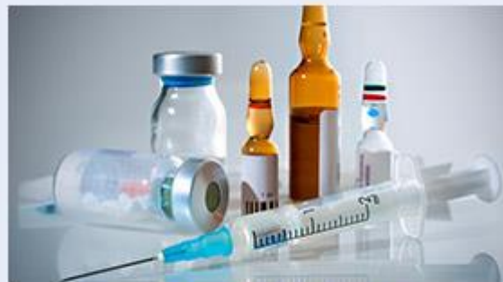
Enhancing the Medical Countermeasures Enterprise