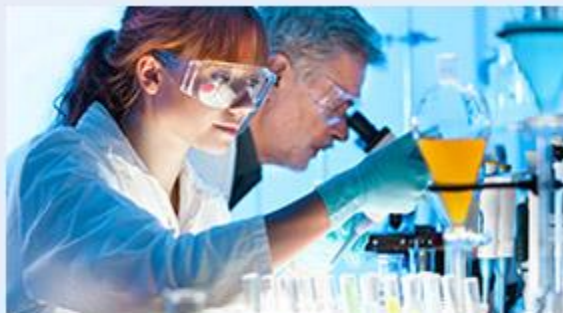
Sustaining Public Health Security Capacity