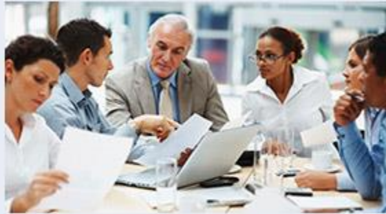
Providing Strong Leadership

U.S. Department of Health and Human Services