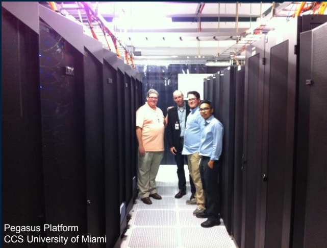
Pegasus Platform CCS University of Miami

One week run time on 7000 CPU generating 0.3 TB of data