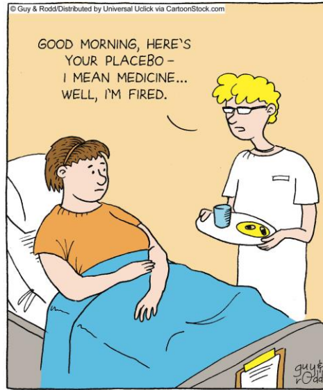
Figures 1 & 2.

"Laughter is the best medicine, but your insurance only covers chuckles, snickers and giggles."