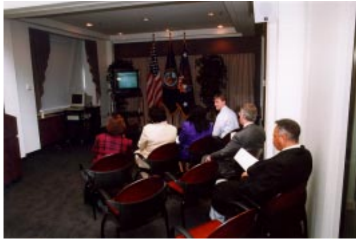
VA Central Office employees learned about the advantages of early mediation at a Mediation Day event held last fall.