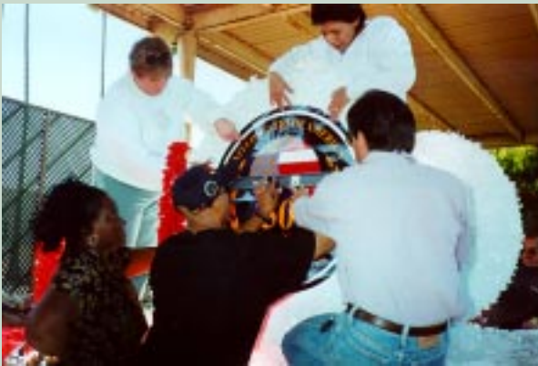
VA Long Beach Healthcare System employees mount a 50th anniversary of the Korean War commemoration logo on the float they created and entered in the Long Beach, Calif., Veterans Day parade.

Thousands of Long Beach, Calif., residents line the streets each year on November 11 to enjoy the city’s annual Veterans Day parade. This past Veterans Day, employees of the VA Long Beach Healthcare System decided for the first time to enter a float in the parade. And for their initial foray into float-making, they chose the 50 th anni-