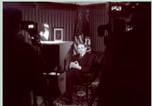
Secretary Principi speaks to employees from the VA Central Office broadcast studio.

Principi said he looked forward to getting out in the field to meet and talk with VA employees personally. He urged VA employees to "treat every veteran who turns to us for the benefits and services he or she has earned with sympathy, compassion and with respect. Many of them come to us in their weakest and most vulnerable moments. Many of them have no other options. Veterans are the reason we exist as an organization. A commitment to service to veterans is a prerequisite to a career in our Department." □