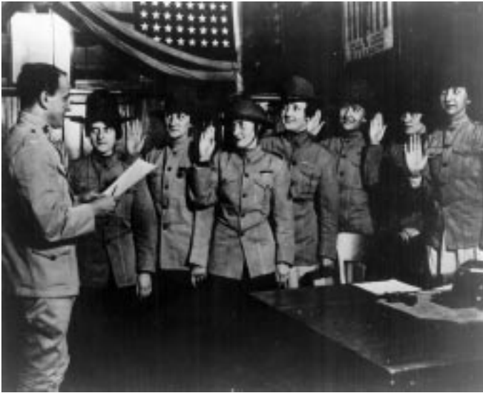
World War I Marine recruits take the oath.

M arch is National Women's History Month, a time to honor the courage and vision of women who challenged social inequities and brought a wrecking ball to the foundations of gender discrimination. Women like Mary McLeod Bethune, who in 1904 scraped together $1.50 and with just five pupils, founded a school for young black women.