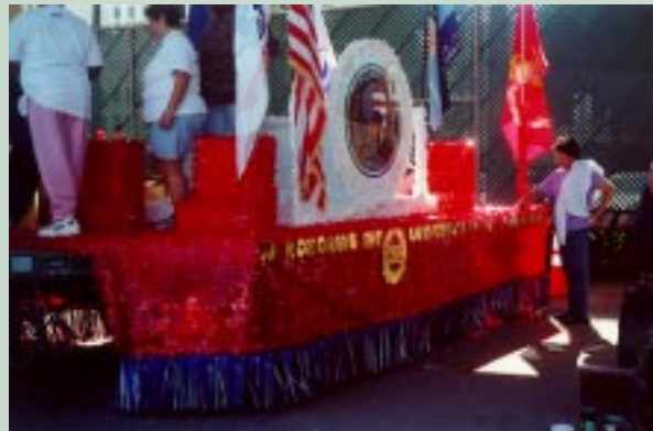
Employee volunteers put the finishing touches on their 50th anniversary of the Korean War-themed float for the Long Beach Veterans Day parade.

Starting from scratch only a week before the parade, the employee volunteers created a red, white and blue float emblazoned with the words, “VA Honoring the 50 th Anniversary of the Korean War,” and featuring the logo and flag of the 50 th anniversary commemoration. They also flew the U.S. and five military service branch flags, and veteran employees in uniforms representing each service branch rode on the float. □