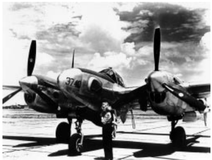
A woman pilot prepares to board a P-38 fighter during World War II.

During the Korean and Vietnam Wars, women served in numerous medical and clerical assignments—in hospitals, MASH Units, intelligence operations groups, information offices, in headquarters and personnel units. In 1950 in Korea, Army nurses supported combat troops defending the Pusan Perimeter, they were in the amphibious landing at Inchon, and joined troops crossing the 38th parallel on their way to the