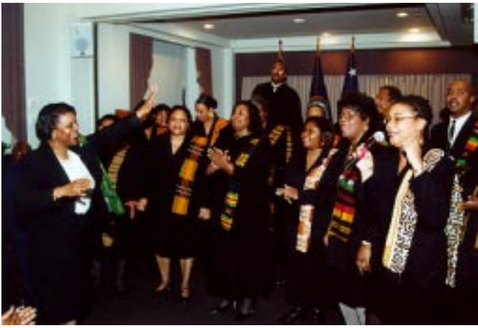
A performance by the VA Gospel Choir was one of several activities celebrating Black History Month at VA headquarters.