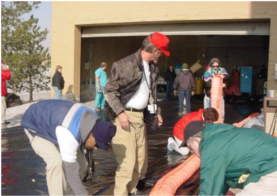
Members of the VISN 8 Haz-Mat/WMD Mobile Hospital Decon Team and the VISN 7 Emergency Medical Response Team set up a decontamination site near the emergency room entrance of the Salt Lake City VA Medical Center.