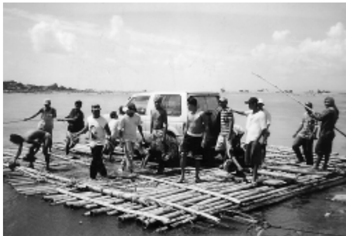
Transportation is a constant challenge for the Manila field investigators, who often must find creative ways of getting where they need to go.