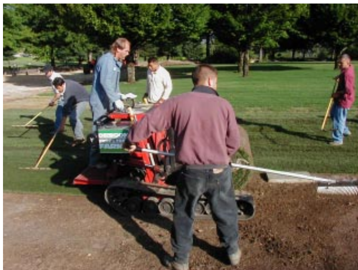
Contract workers place sod during gravesite renovation at Willamette National Cemetery in Portland, Ore.

T he words “national shrine commitment” are heard more and more at VA’s national cemeteries. They appear in the 1973 law that established the national cemetery system within VA and decreed: “All veterans cemeteries shall be considered national shrines as a tribute to our gallant dead.”