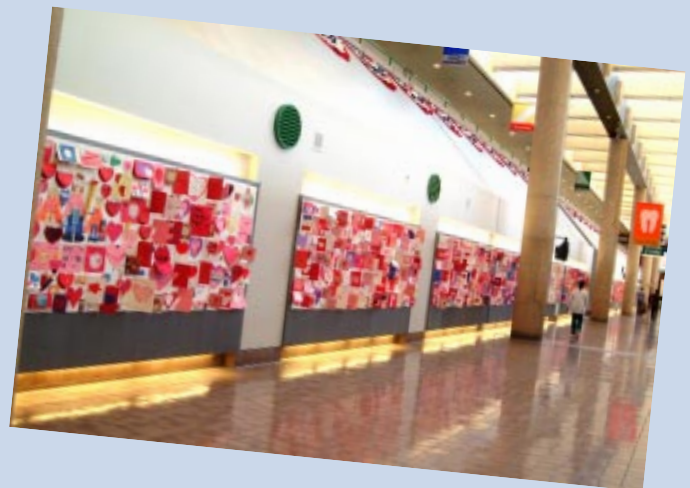
At the McGuire VA Medical Center in Richmond, 189 feet of wall space was covered with colorful homemade valentines during National Salute to Hospitalized Veterans. The cards and letters, many from schoolchildren, poured in for patients there and all over the country thanks to advice columnist Ann Landers' annual call to her readers to send valentines to hospitalized veterans during National Salute week.