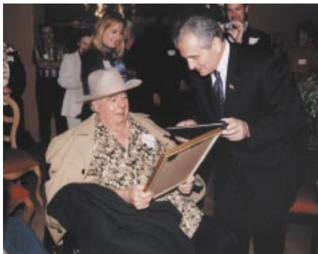
Secretary Principi presents a certificate of appreciation and letter from President Bush to WWII veteran Glenn Bell, founder of the Taco Bell restaurant chain. Bell was one of more than 60 men and women honored for participating in the Veterans History Project.

Rancho Santa Fe is a wealthy community in southern California, but the veterans Secretary Principi honored there recently showed him that their proudest accomplishments came as young soldiers, sailors and airmen during World War II, not as