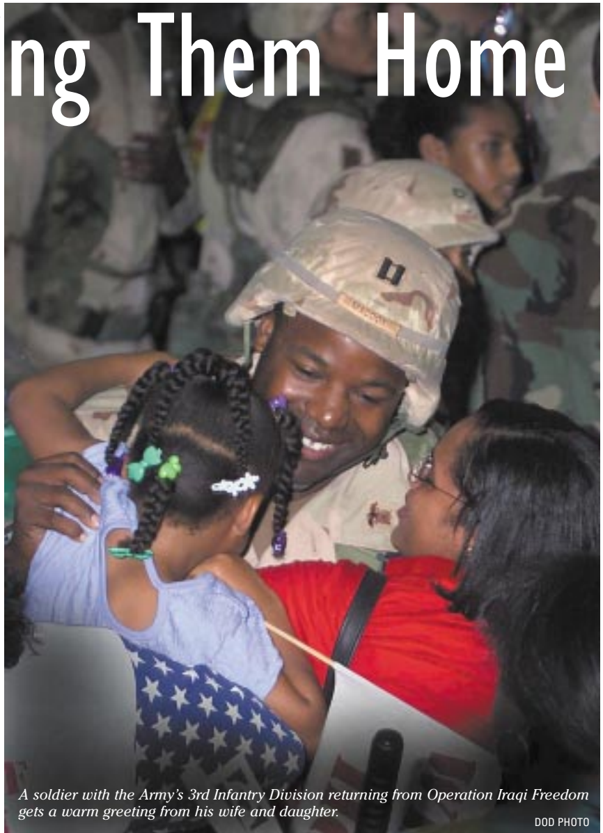
A soldier with the Army's 3rd Infantry Division returning from Operation Iraqi Freedom gets a warm greeting from his wife and daughter.