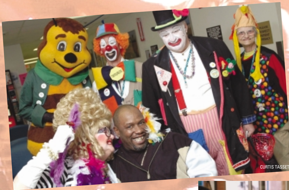
Each year during the week of Valentine's Day, the halls of VA medical facilities all over the country fill with schoolchildren, celebrities, political and sports figures, all there to honor veterans.