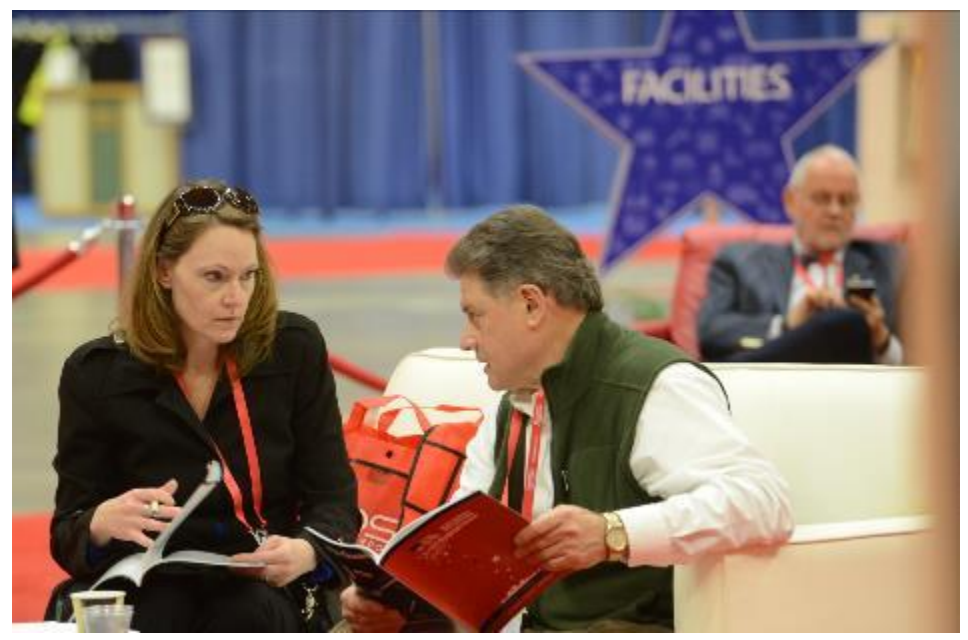
VOSBs engage, network, and access contracting opportunities at #NVSBE2016 in Minneapolis.

Veteran Small Business Owners Converge at National Procurement Event