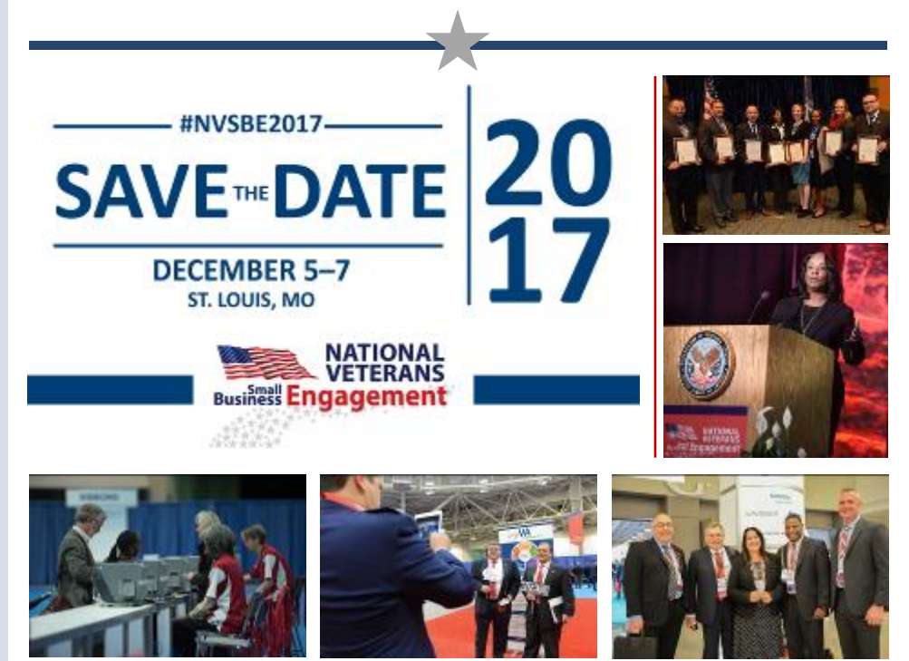
#NVSBE2016 featured award presentations, speeches by top VA officials, learning sessions, leadership roundtables, VOSBs from across the United States, and much more.

VA will continue to offer the Veteran small business community access to unique opportunities to foster relationships, expand networking, and potentially secure contract awards by hosting industry-specific access events throughout 2017. If you missed last year's event, be sure to register for the 2017 NVSBE, December 5–7, in St. Louis, Mo. For more information about NVSBE, visit www.nvsbe.com.